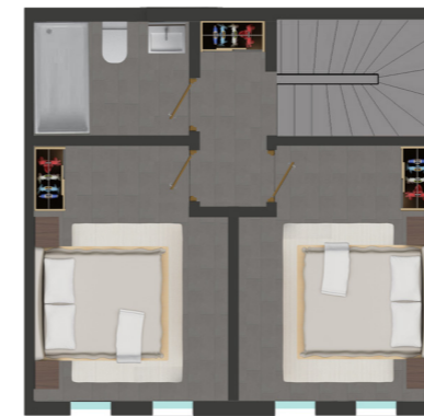
DUPLEX FIRST FLOOR